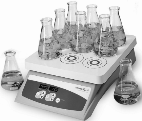
VWR Advanced Multi-Position 9