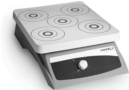
VWR Standard Multi-Position 5